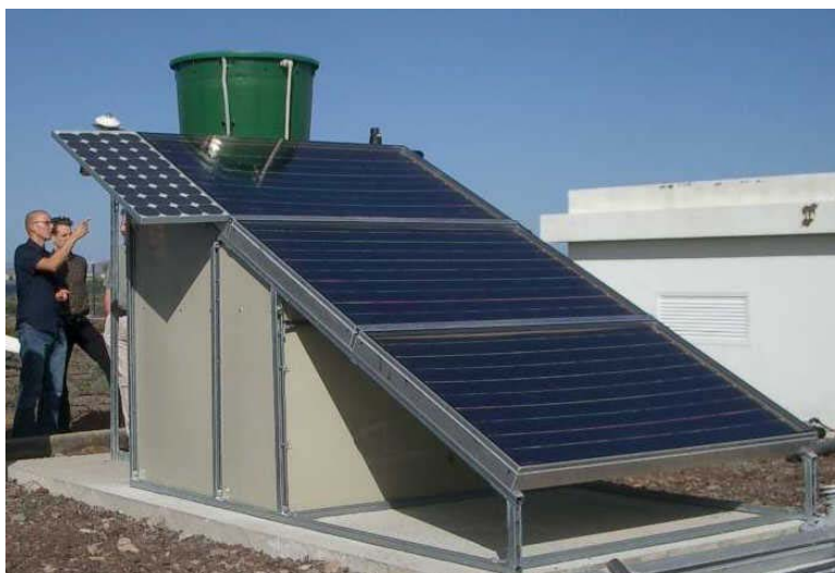
Figure 1: Improved flat plate collectors in a process heat application: double glazed anti-reflective flat plate collectors from ESE (Belgium) are used in this compact solar driven desalination system developed by Fraunhofer ISE, Germany.

The collector developments are on-going and will be continued in 2006.