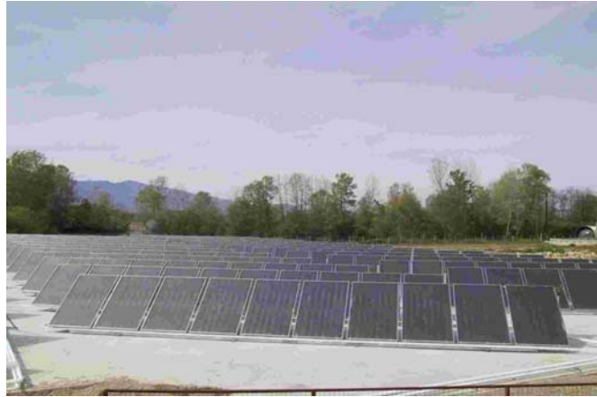
Dairy, Trikala, Greece

AEE - Institute for Sustainable Technologies Operating Agent for the Austrian Ministry of Transport, Innovation and Technology